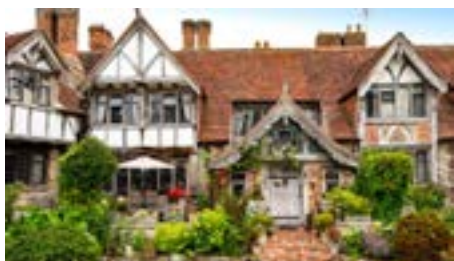
Tudor Close hosted not only stars like Bette Davis and Cary Grant, but the murder mystery games which would go on to inspire the Clue boardgame.