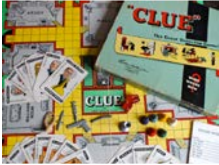
The original American version of Clue, published by Parker Brothers in 1949

comic books, and jigsaw puzzles. It's the second most popular board game in the world, and new editions continue to be published — including one in January of 2023 which updates “Mrs. White” to a younger-looking chef “Chef White” with white, undercut hair, tattoos, and punk boots.