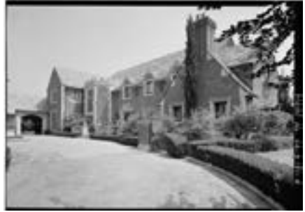
Though most of Clue was filmed at Paramount Studios, the exterior gate and ballroom scenes were filmed at the Max Busch House in Pasadena, CA which burned down in 2005