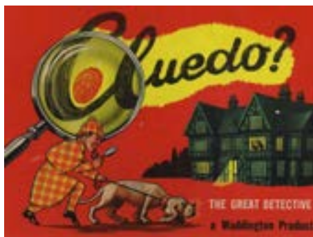
The original Cluedo?, published by Waddingtons in 1949