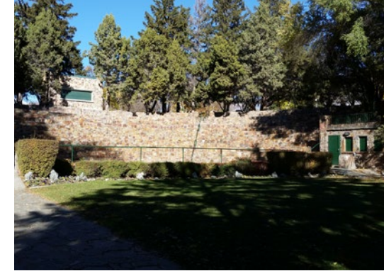
▲ Top Left: The Springville Museum of Art was constructed from 1935–1937 with funds from the Works Progress Administration (WPA), a New Deal agency. Top Right: The American Fork Amphitheater was also a 1930s WPA project, intended to provide recreational and landscaping amenities for the Utah State Training School and the community.