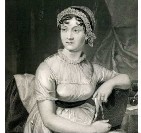
▲ Above: Engraving from 1873 featuring Jane Austen

Edward visits the Dashwoods and tells them that, to his great relief, Lucy Steele has thrown him over for his newly wealthy brother, Robert. He declares his love for Elinor. The Dashwood sisters find love and learn that there is value in both "sense" and "sensibility."