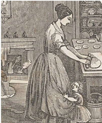
A working class woman of the 19th century

The book Jane Eyre was one of the first books to protest women’s condition in the nineteenth century. Though it stays away from any direct attacks on Victorian society, the book depicts this problem by portraying the many men during Jane’s life’s journey who try to establish some form of power or control over her.