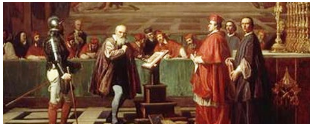
Galileo before the Holy Office, by Joseph-Nicolas Robert-Fleury

150,000 PEOPLE WERE TRIED DURING THE INQUISITION. While tens of thousands were tortured or imprisoned, the number of executions is estimated at 3,000 to 5,000.