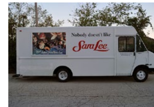
Sara Lee truck

Despite his success in the theater, composer Mitch Leigh continued to work his original job, writing jingles for a major advertising agency. His most recognized tune might not be The Impossible Dream , but rather Nobody Does't Like Sarah Lee .