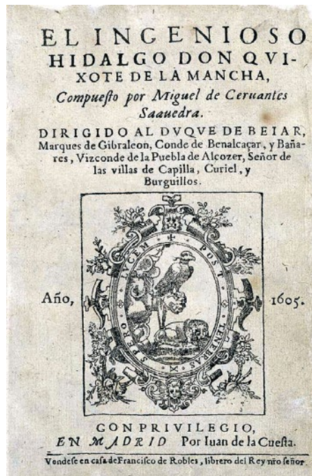
Title page of the first edition

Don Quixote has been TRANSLATED INTO ALL MAJOR LANGUAGES in over 700 editions.