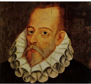
MIGUEL DE CERVANTES Author of Don Quixote

Although the exact date and location of Cervantes' birth is not known for sure, it is believed to be in September of 1547 in a Castilian city near Madrid. His father, Rodrigo was a barber/surgeon and his mother, Leonor de Cortinas was the daughter of a nobleman who due to losing his fortune, was forced to arrange the marriage of his daughter to help settle his debts.