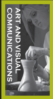
ART AND VISUAL COMMUNICATIONS