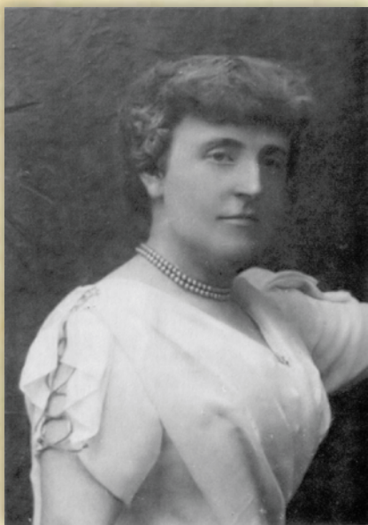
Frances Hodgson Burnett

“I am writing in the garden. To write as one should of a garden, one must write not outside it, or merely somewhere near it, but in the garden.” ~ Frances Hodgson Burnett