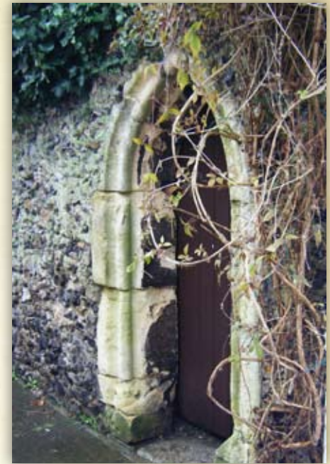
Great Maytham Hall garden wall door