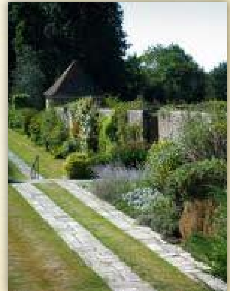
Great Maytham Hall garden