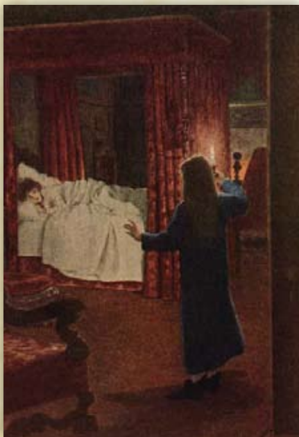
"Are you a Ghost" An original Illustration from "The Secret Garden"