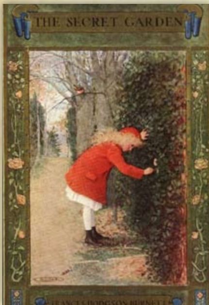
The original Secret Garden book cover