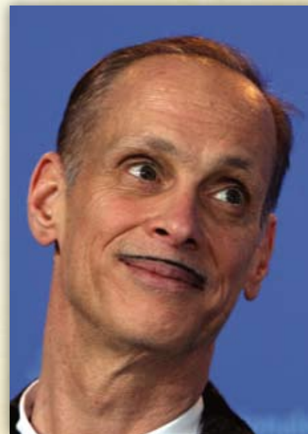
John Samuel Waters (born April 22, 1946) is an American filmmaker, actor, writer, journalist, visual artist, and art collector, who rose to fame for his off kilter films like Hairspray (1988).