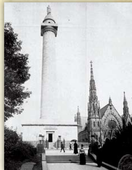
Completed in 1829, Baltimore's Washington Monument (ca. 1890), was the first architectural monument planned to honor George Washington.