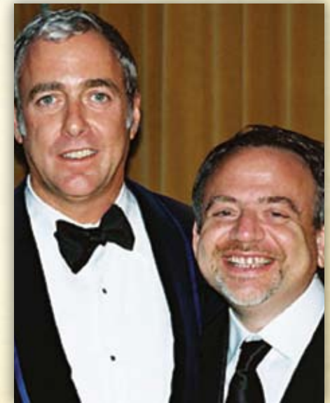
Co-lyricist Scott Wittman and composer/co-lyricist Marc Shaiman earned five Academy Award nominations, a Tony Award and a Grammy Award for their work on the musical Hairspray .