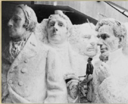
Sculptor Gutzon Borglum standing in front of model depicting Mount Rushmore's intended final design

Wood's famous work, "American Gothic". Many of the nation's most memorable skyscrapers (the Empire State Building, the Chrysler Building, and Rockefeller Center) were completed in the early 30s. In 1937 the Frank Lloyd Wright masterpiece of home design, "Falling Water", was built. The sculptor, Gutzon Borglum, was able to complete his Mount Rushmore Memorial with funds supplied by the Public Works of Art government program.