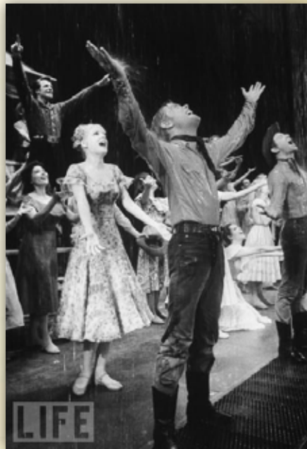
110 in the Shade on Broadway, 1963