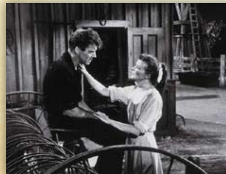
Scene from the 1936 film "The Rainmaker"