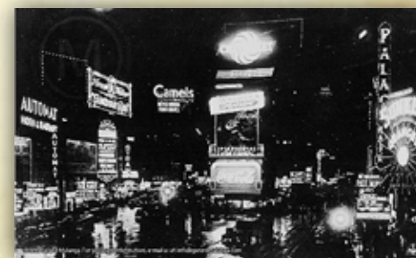
Times Square, 1930's