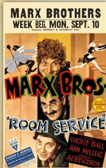
Room Service movie poster, 1938